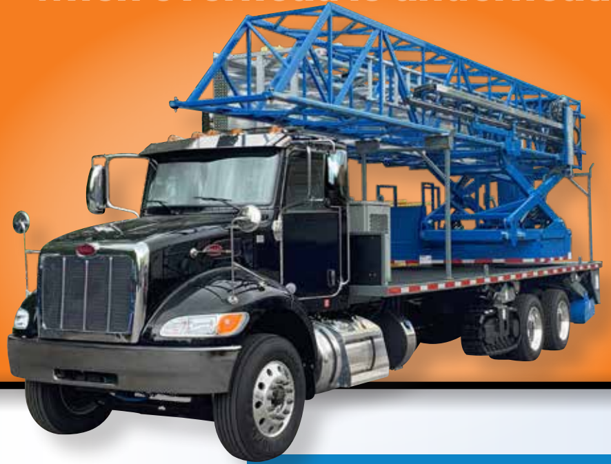
MID-SIZED TRUCK MODEL

The HPT43 has an extended platform length of 43 ft. and provides 2,000 sq. ft. of under-bridge area from fixed point on the bridge deck.